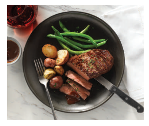
Learn more at experienceparkland.com/antigonish

Layers of fresh mascarpone custard with rum and coffee-soaked ladyfingers finished with whipped cream