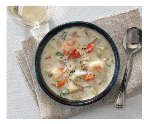
Learn more at experienceparkland.com/ajax

Our famous seafood chowder recipe is a daily staple on the menu at every Parkland property. Prepared fresh daily with high quality Maritime seafood you can enjoy this recipe all year long!