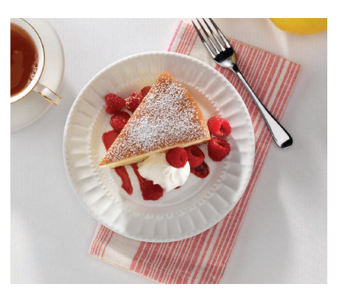
Learn more at experienceparkland.com/ajax